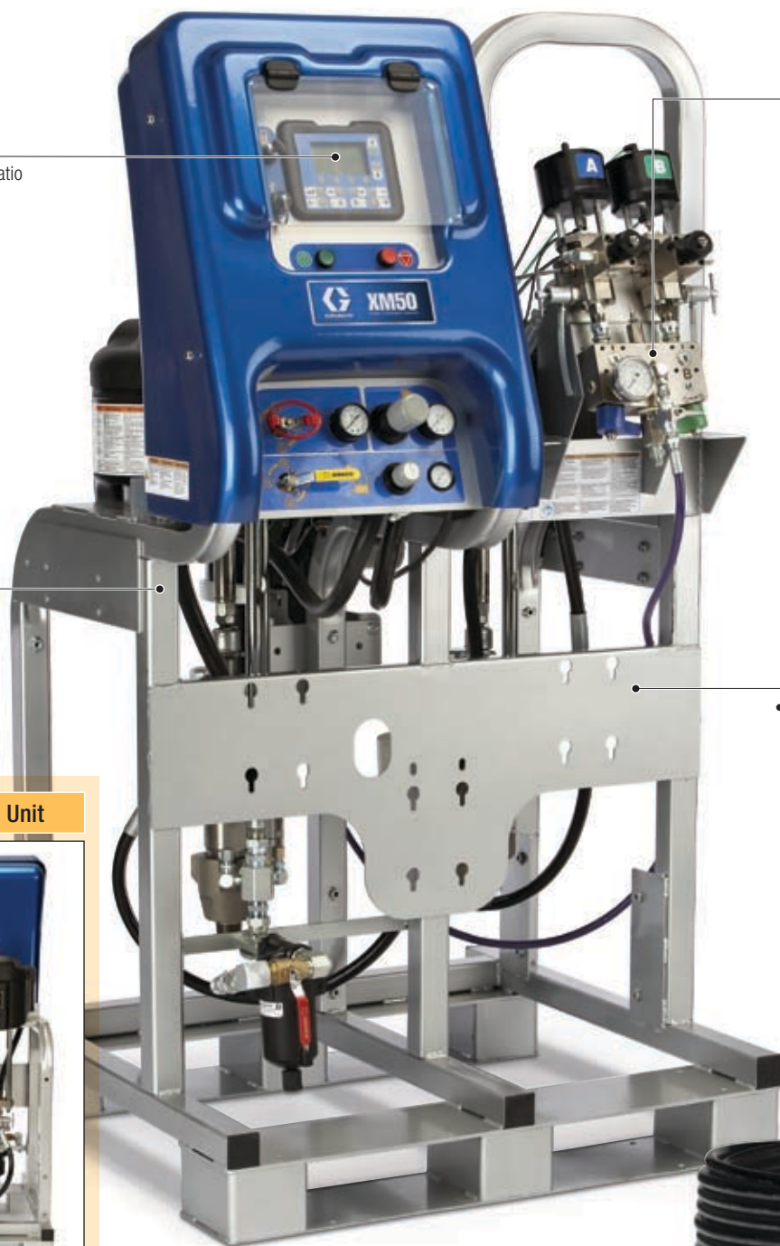
Graco XM Plural-Component Sprayer (base model)*

Xtreme pumps and Merkur™ flush pump are standard on the base unit. Easy crane transport using eye hooks on air motors.