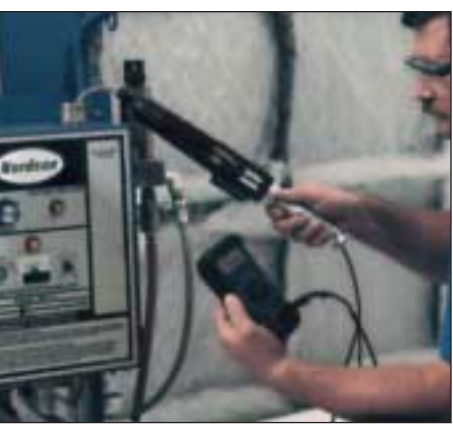
Flexible cable attachment measures voltage inside high-voltage power supply for powder (left) and liquid (right) coating application systems.