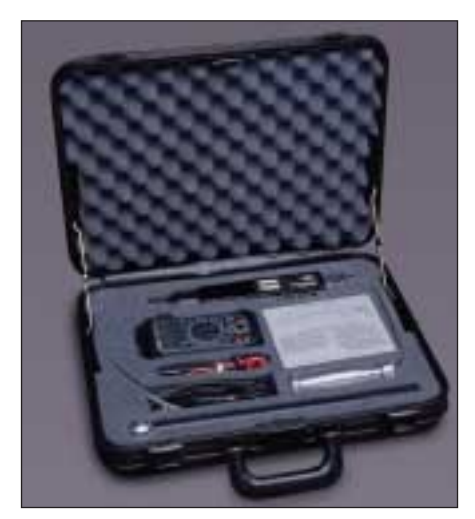
Durable, lightweight attaché case facilitates transportation and storage of Nordson's kV meter kit.

Output characteristics differ between various high-voltage power supplies. As a result, conventional kV meters allow relatively high currents to flow through them. This can produce inaccurate high-voltage measurements of electrostatic components in a powder or liquid coating system. Such inexact