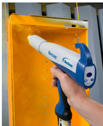
Nordson powder spray guns provide optimum coating performance.