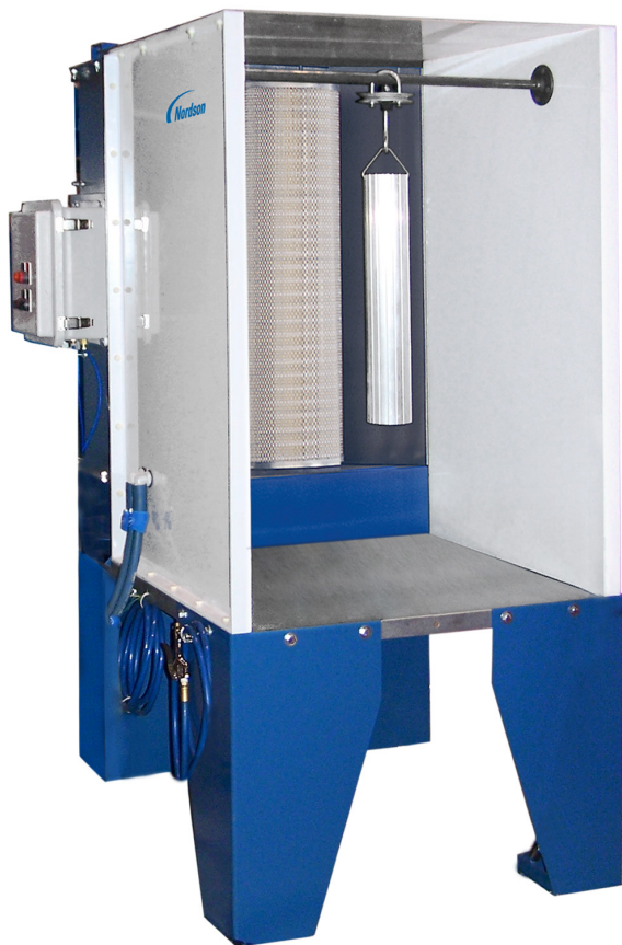
Nordson Econo-Coat 1001 booth shown with optional poly canopy.

Ultra-compact powder spray booth/ recovery system for batch powder coating