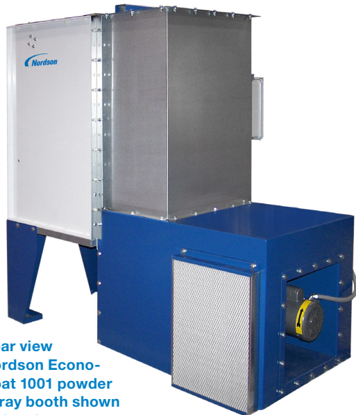
Rear view Nordson Econo-Coat 1001 powder spray booth shown with poly canopy.

For more information, speak with your Nordson representative or contact your Nordson regional office.